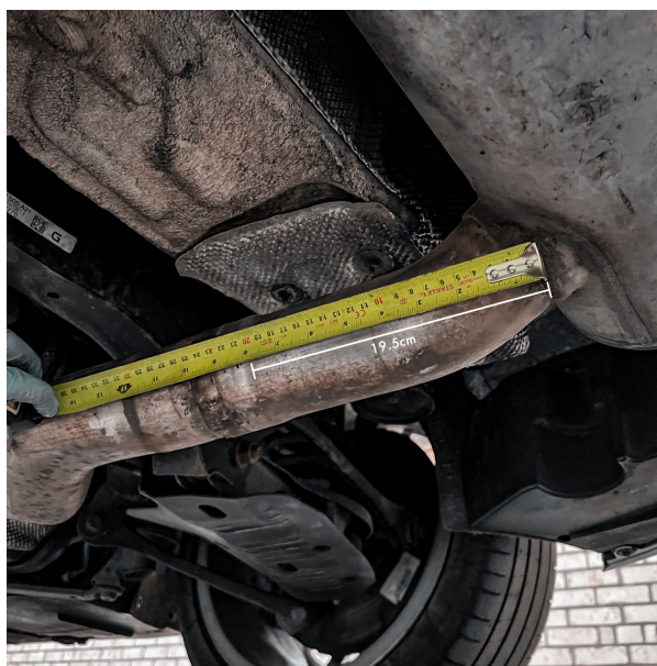
2. Measure 19.5cm away from the backbox, as shown above. Final position may vary \pm 0.5 cm.