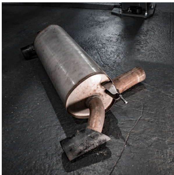
4. Ensure the cut you make is as parallel as possible.