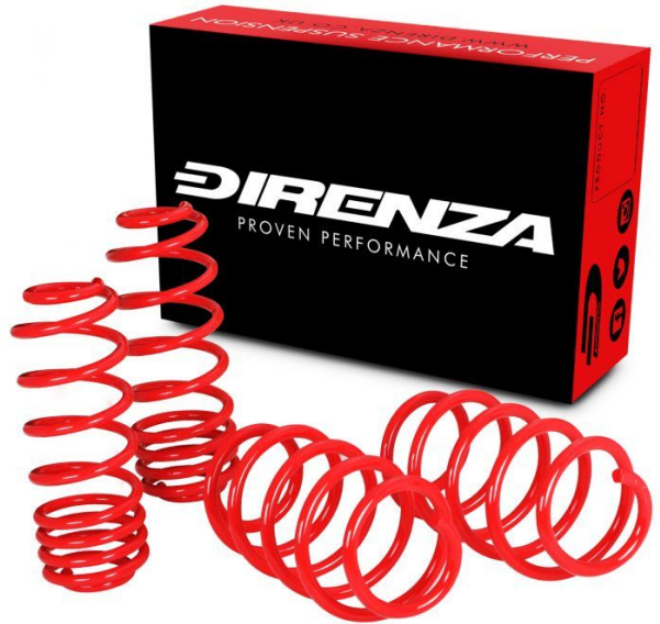
BMW F20 M135i 20mm/30mm Lowering Springs.