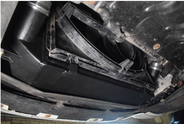
17. Step 16 continued.