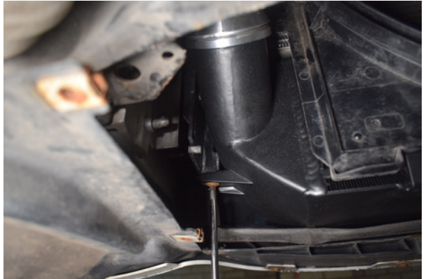
18. With the tabs lined up, secure the intercooler using the supplied hardware.