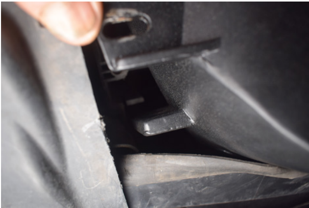
15. Ensure all the locating tabs line up and slot into position.