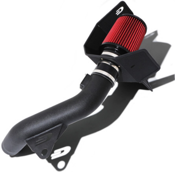
BMW F20 M135i Cold Air Induction Kit