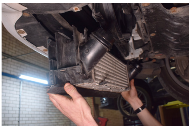
11. Step 10 continued.