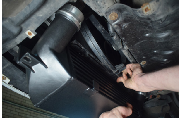
14. Pull the fan slightly away allowing you to lift the MVT into the available space.