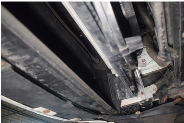
12. Step 10 continued.