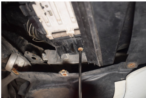
9. Step 8 continued.