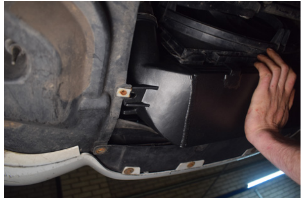
16. You can now push the MVT Intercooler up and above the lower edge of the front bumper.