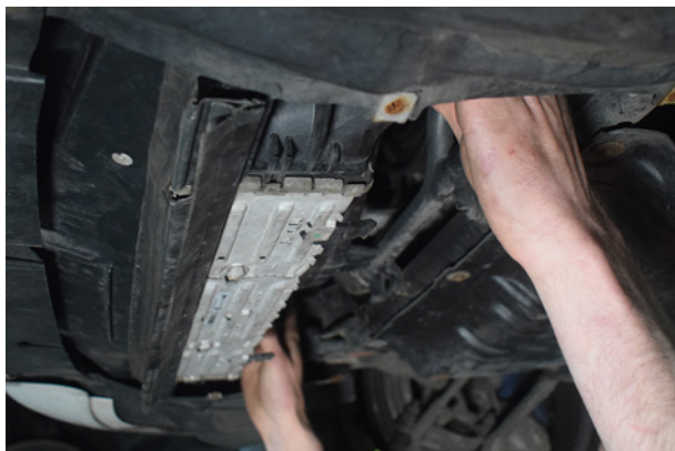
10. You can now remove the intercooler.