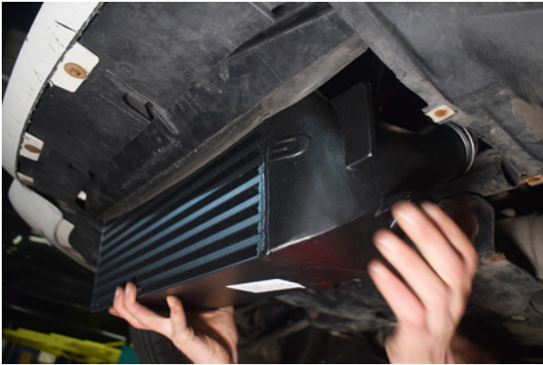
13. You can now install the Direnza Performance MVT Intercooler.