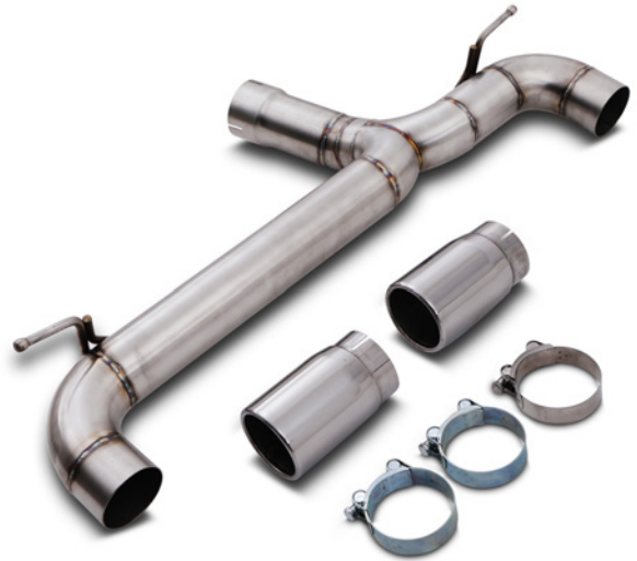
BMW F20 M135i Exhaust Backbox Delete.