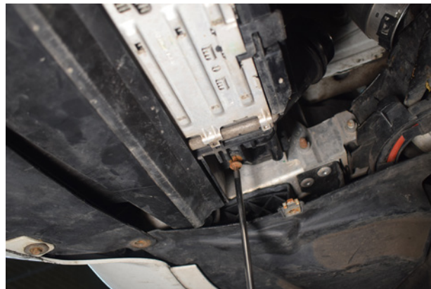
8. Undo the 2x T27 torx securing the OEM intercooler to the car.