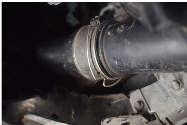
7. Step 6 continued.